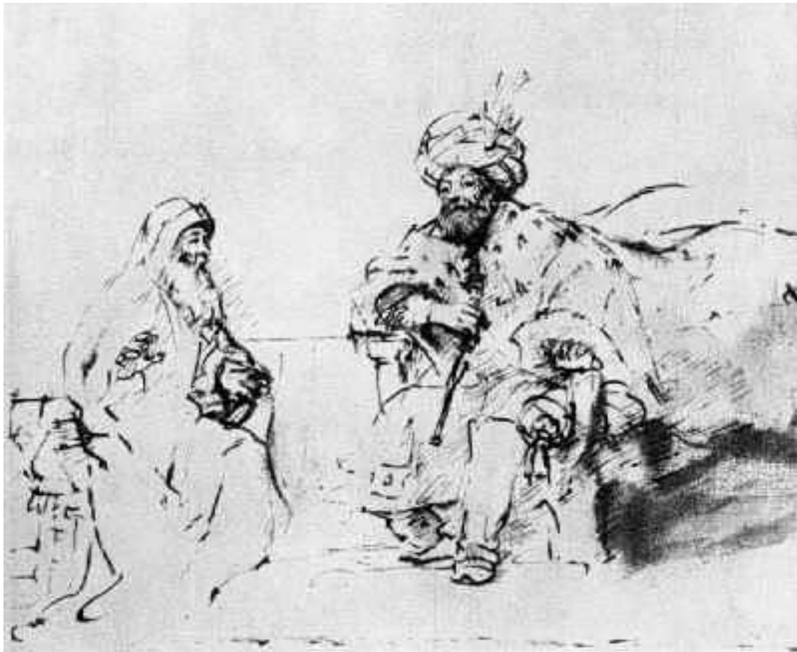
Nathan Admonishing David, Rembrandt c.1655