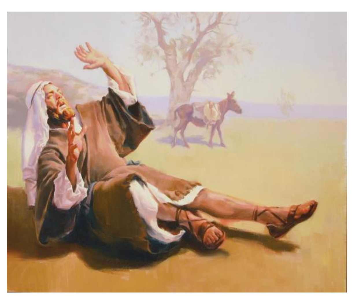
SAUL ON THE ROAD TO DAMASCUS