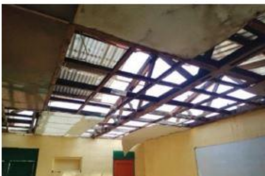
Onesua College – Damage to Junior Science Lab