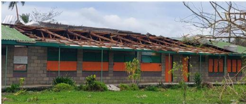
Onesua College Classroom roof destroyed by Cyclone Kevin in March

Category 4 Tropical Cyclones Judy and Kevin hit Vanuatu within 48 hours of each other on March 1 and 3 2023. The Presbyterian Church of Vanuatu has taken some time to gather information about damage to schools, churches and other property as a result of these cyclones. Many rooves were ripped off and water damage was sustained as a result, along with other impacts. Due to the isolated nature of many of Vanuatu's islands it has not been easy getting all these details together. But information recently received has estimated that repairs to PCV property on several affected islands will cost at least NZD $320,000. Onesua Presbyterian College on Efate Island was assessed separately and needs extensive repairs. This has not yet been costed but will be high.