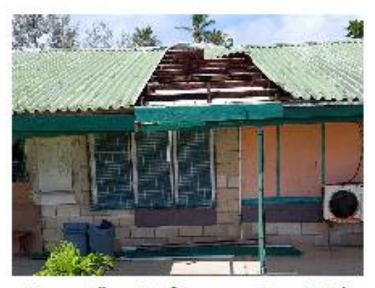
Onesua College - Roof Damage on Computer Lab