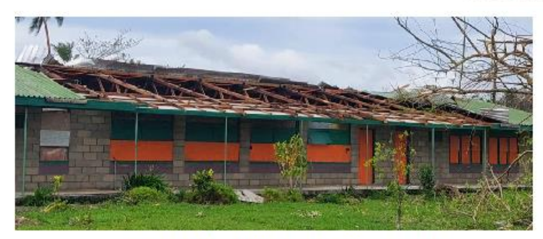
Onesua College Classroom roof destroyed by Cyclone Kevin in March

Category 4 Tropical Cyclones Judy and Kevin hit Vanuatu within 48 hours of each other on March 1 and 3 2023. The Presbyterian Church of Vanuatu has taken some time to gather information about damage to schools, churches and other property as a result of these cyclones. Many rooves were ripped off and water damage was sustained as a result, along with other impacts. Due to the isolated nature of many of Vanuatu's islands it has not been easy getting all these details together. But information recently received has estimated that repairs to PCV property on several affected islands will cost at least NZD $320,000. Onesua Presbyterian College on Efate Island was assessed separately and needs extensive repairs. This has not yet been costed but will be high.