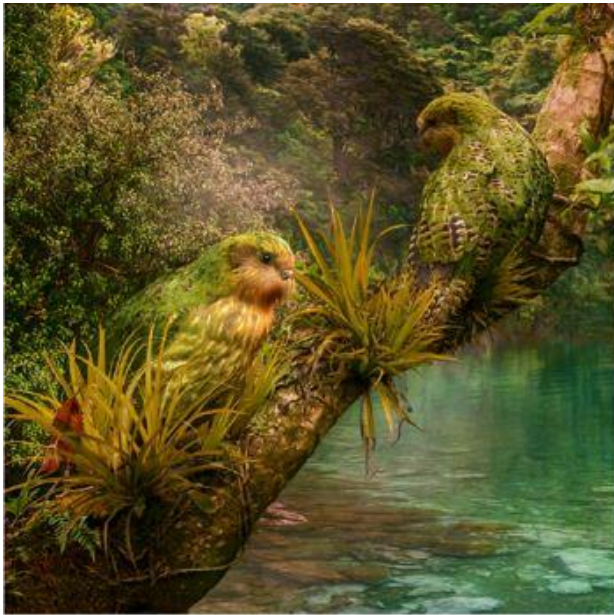
A Hidden World